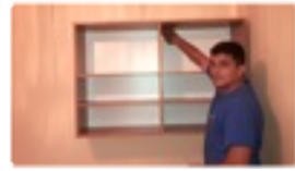
LIFE CENTER A SUMMER OF REPAIRS & LOOKING GOOD