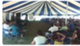
SUMMER ENDS GREAT TESTIMONIES FROM CAMP