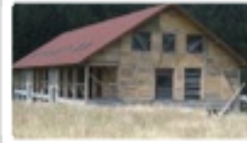
SUCEAVA NORTHERN CAMP COMPLETE THE BUILDING

The Lord is good! We're in the 9th month of this year; all of us are climbing up in life to reach our potential that Christ has called us to! However, many of us are looking back thinking we should have done life differently and accomplished more by now. So let's do better this next step, in the hope that we'll do and fulfill God's will with the little time we have left. Let us connect to the One in whom we have our living and then watch the difference.