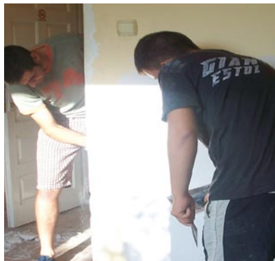
REPAIRS TO LIFE CENTER