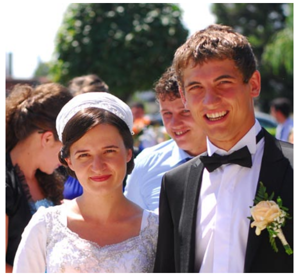
Wedding time at Life Center