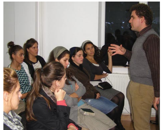
Teaching New students at Life Center

blessed them with the message of salvation, and motivated them to get out of the street. He encouraged them to every day pray to Jesus, and trust God to be rescued out from the street.