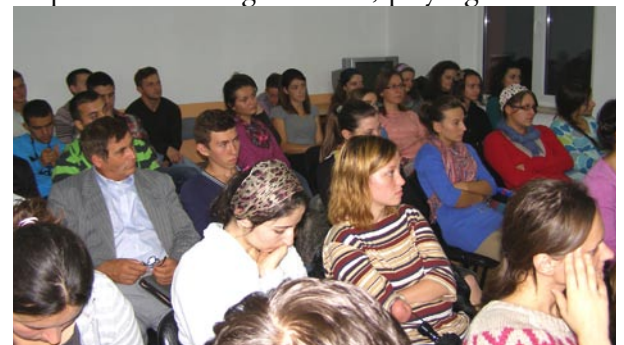
The class of new Life Center students

The street people, old, young and teenagers thanked us for the good food and the message of life they had received and at the end asked for prayer, and we asked them to give their lives to Christ, and most of them came up to receive personal prayer. And our Life Center students helped with serving the meal, playing and