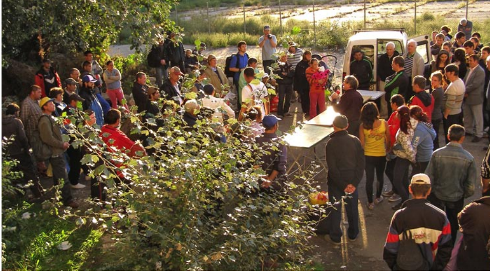
Life Center Outreach to the Street people

A couple of our students stated that they may have ended up on the street as well, if God's saving hand was not over them. The Lord sent the Life Center to rescue them from their own downward road.