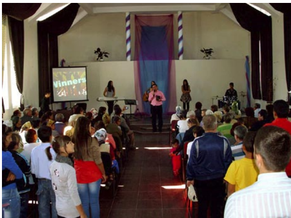
Teaching and Staff meetings