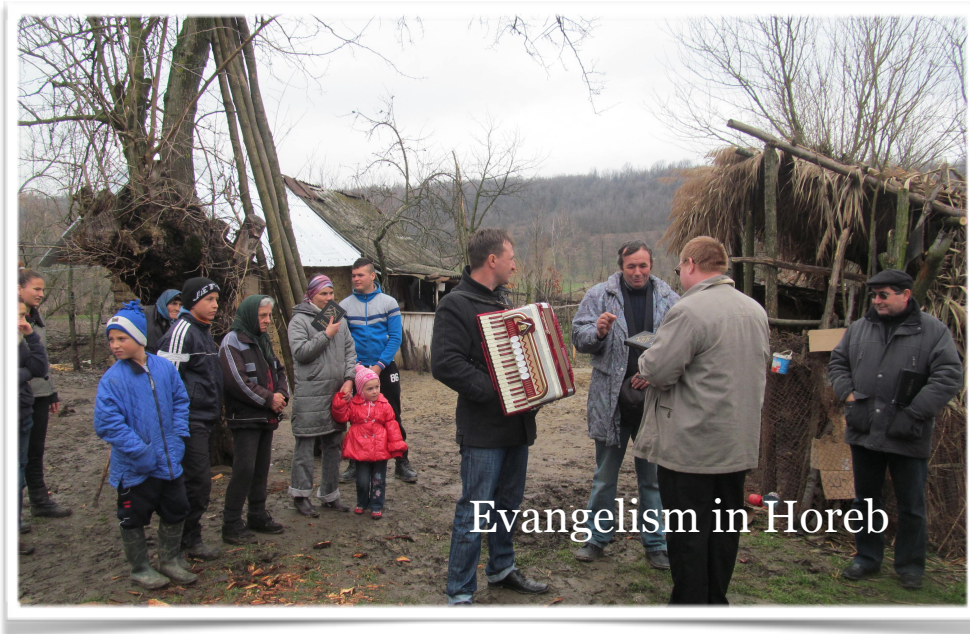
Evangelism in Horeb

Bless the Lord at all times and His praises shall continually be in our mouths!