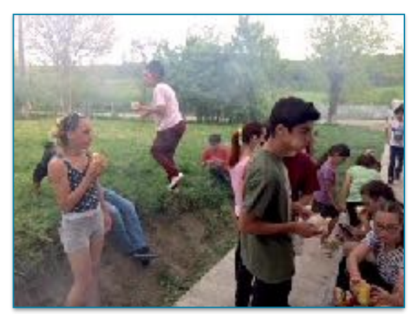
Using the vans to reach others.

This is our first given divine duty to make disciples and then God will bring the blessings of the multiplication and the increase in all things.