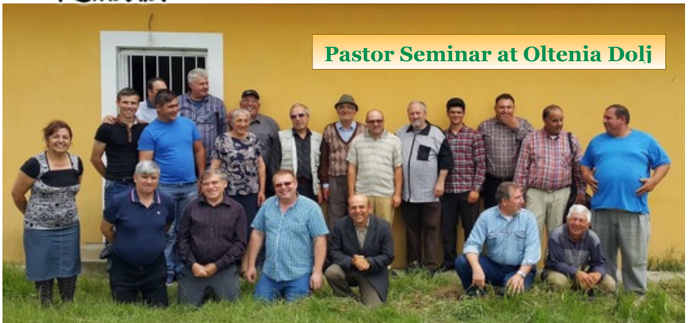
Pastor Seminar at Oltenia Dolj