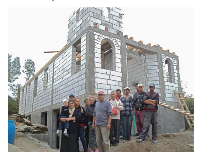
Cornita Church built by church members

of new faith they never heard before, and it's a real open door to preach the Gospel. But remember this always stays true, the harvest workers are just a few but the fields are white ready for a full harvest.