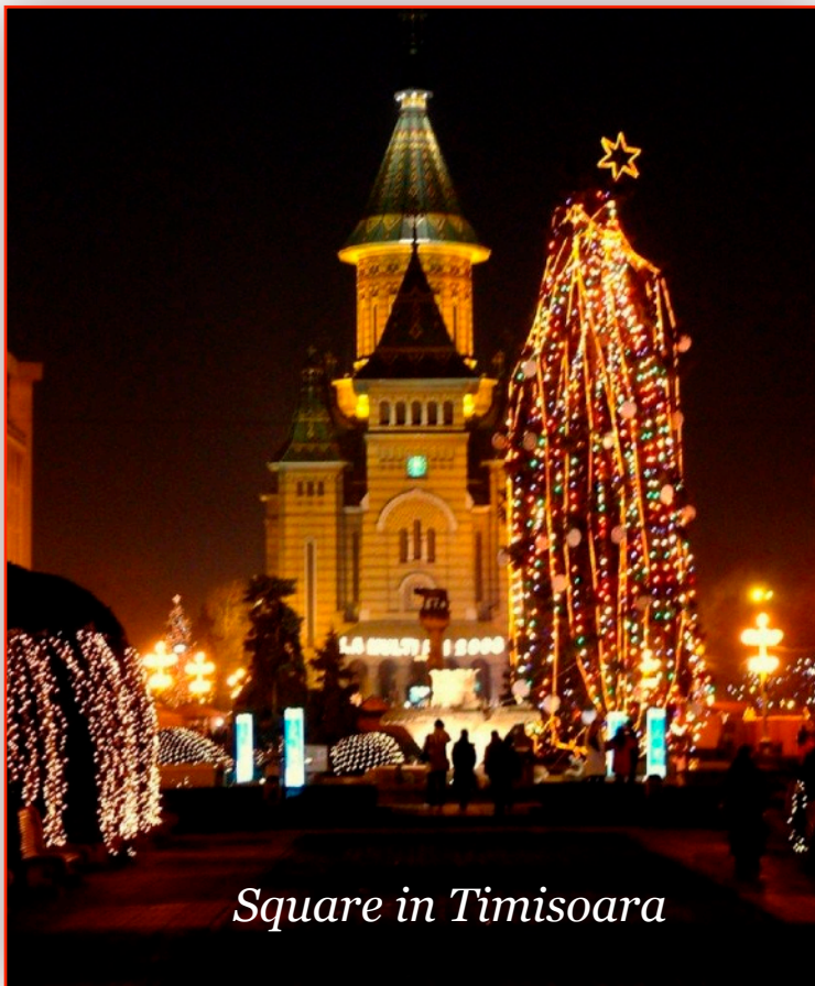
Square in Timisoara

The birth of Christ signifies the birth of every new born Christian believer on the earth. All are born back to the original spiritual relationship with our maker Father God. That's why on Christmas we celebrate the birth of Christ, this most Happy Birthday celebration as our rebirth along with our Savior's.