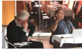
CHURCH PLANTING AND DISCIPLESHIP