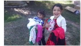
HELPING THE NEEDY SHARING JESUS