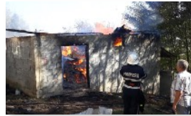
FIRE DESTROYS BUILDINGS