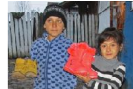
THE GIFT OF SHOES For the cold winter.