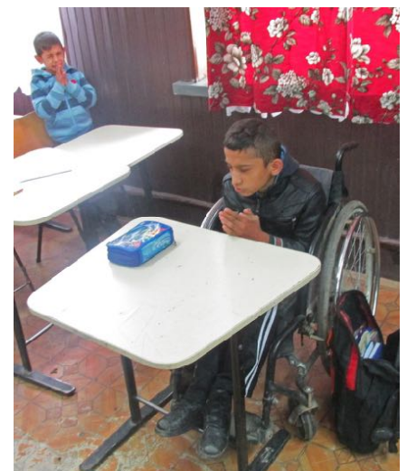
This student studies with out a Bible book.