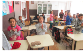
BOOKS NEEDED IN THE CLASSROOM Your help is needed