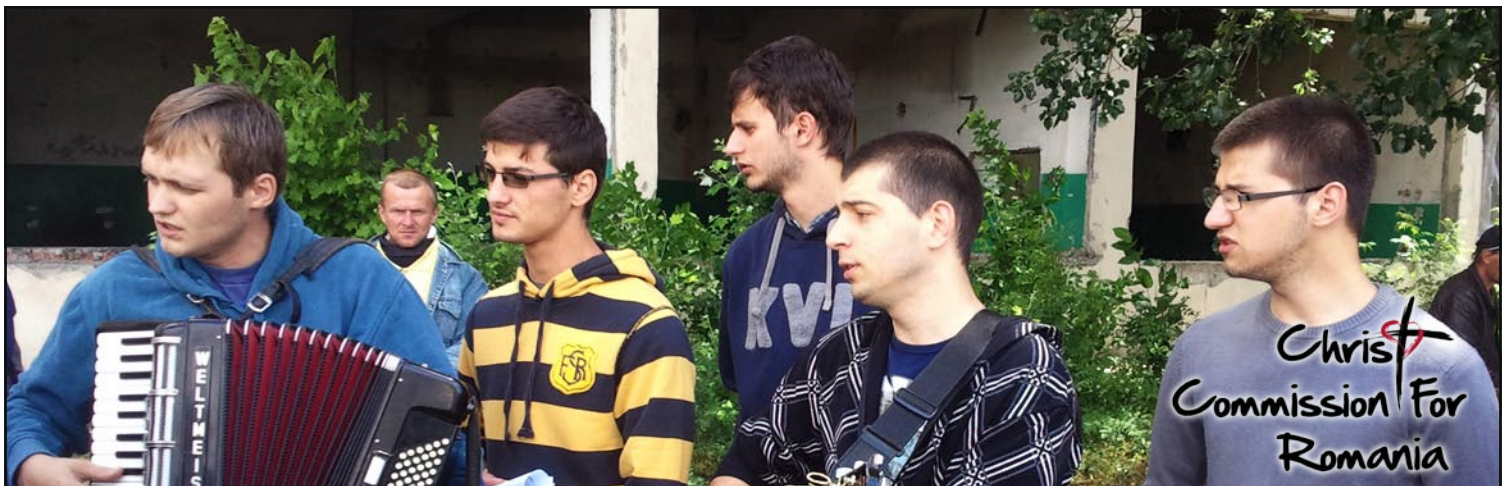
Christ Commission for Romania