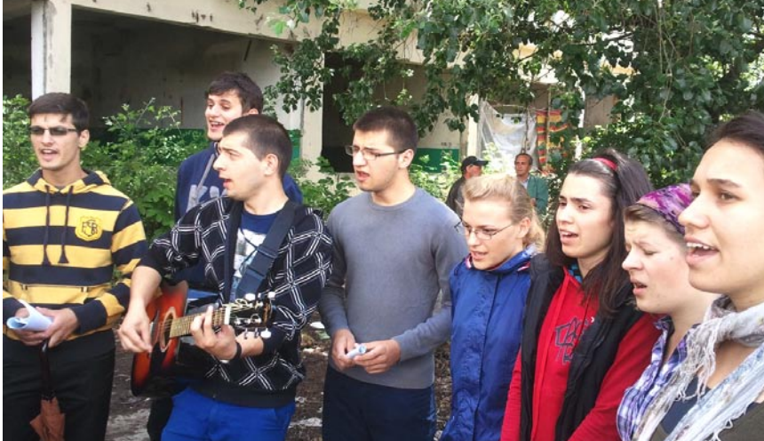
Life Center Team leading Worship

Once a month we schedule a special day to feed the street people, orphans and the very poor that are always hungry and lacking hot meals. We fed 107 hungry people and kids at one time, offered them a hot meal, and after it we had a life songs concert and committed them into Jesus' hands. They were so blessed, some with tears in their eyes, and many said they had the best meal in their life, and they felt they were treated like kings and queens and they had the best time in their lives. We had truly enjoyed we could go by faith and make it happen, so everyone of us was blessed and left joyfully.