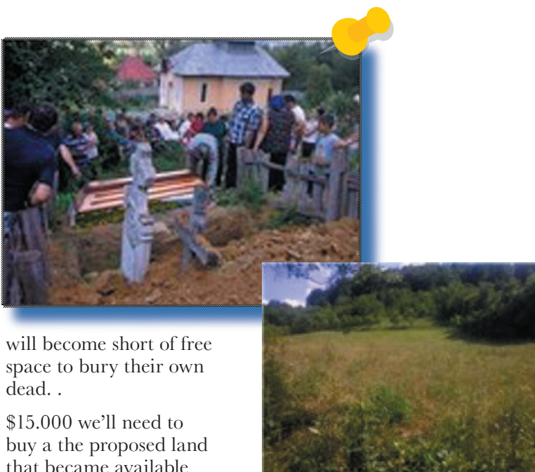
New land for cemetery

$15.000 we'll need to buy a the proposed land that became available in the town of Cordun that will be used also for the surrounding villages of believers around Cordun.