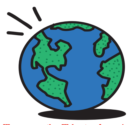
We are on the Web at ccfromania.com

Let's pray this fund will be provided, this will help the establishment of the Cordun church.