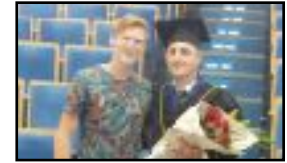
GRADUATION THANKS AND UPDATE