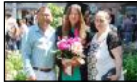
LIFE CENTER STUDENT STORIES