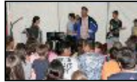
SUMMER CAMPS REACHING KIDS