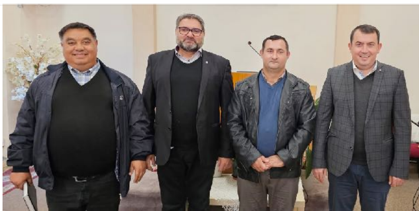
Some of the leaders we spent time with

Our main ministerial work was meeting with pastoral teams and leaders who needed our direct contact and spending time with each one of them. A Romanian businessman paid our traveling expenses just to make ourselves available for these timely special meetings. As it turns out, the ministry has been more efficient by strengthening and leading local leaders behind the scenes than even pulpit teaching or preaching. Lately this is where my heart is since this sort of personal ministry is most lacking in Romania; leaders are forsaken, left alone to fight the frontline war while are busy to serve and fight for