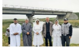
OPEN CHURCH NEW BELIEVERS