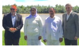
PASTOR WITH BAPTISM SAINTS