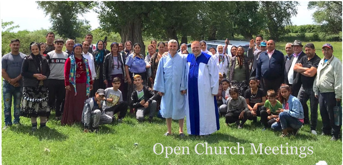
Open Church Meetings