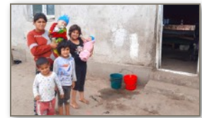
MORBI CONGUE MAGNA NON LACUS HOME REPAIR