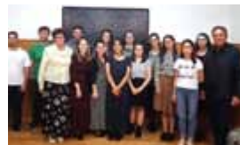
LIFE CENTER 2019-2020