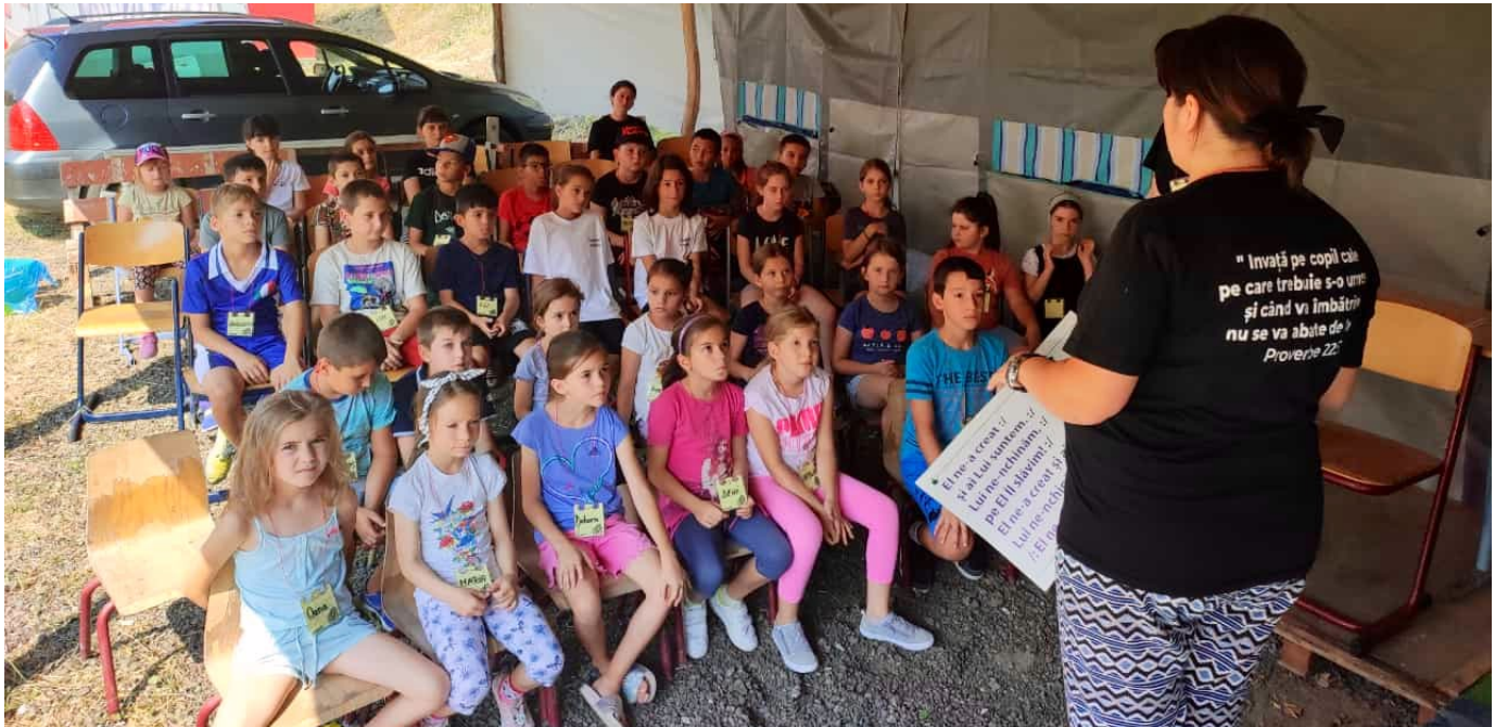
Summer means Camp and Kids meetings!